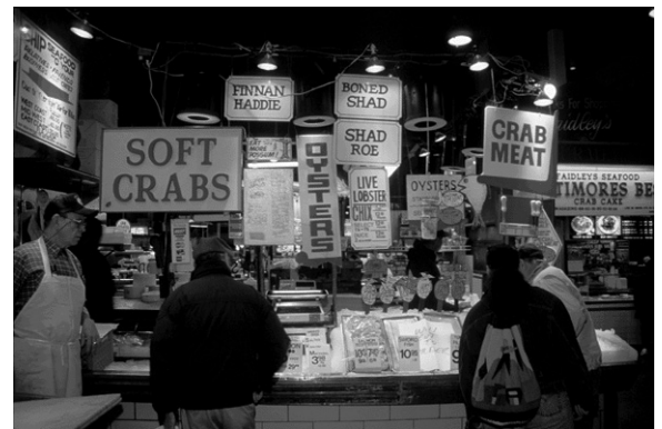
Baltimore loves its crabs—whether steamed or in tasty crab cakes.