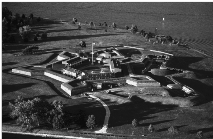
The star-shaped Fort McHenry is a famous point of interest in Baltimore. It was the valiant defense of the fort during the War of 1812 that inspired Francis Scott Key, a lawyer and amateur poet, to compose the Star Spangled Banner.

Participation is limited to the first 50 qualified applicants. Each participant will be expected to register for the Institute's 2008 Annual Meeting in Baltimore, MD. No additional fees are charged for the New Faculty Development Consortium. ■