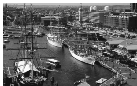
Scenic views of Baltimore's harbor.